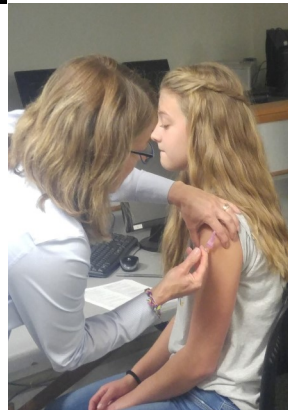
Informing & educating