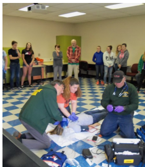
Policies & Plans