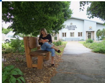
What is public health?