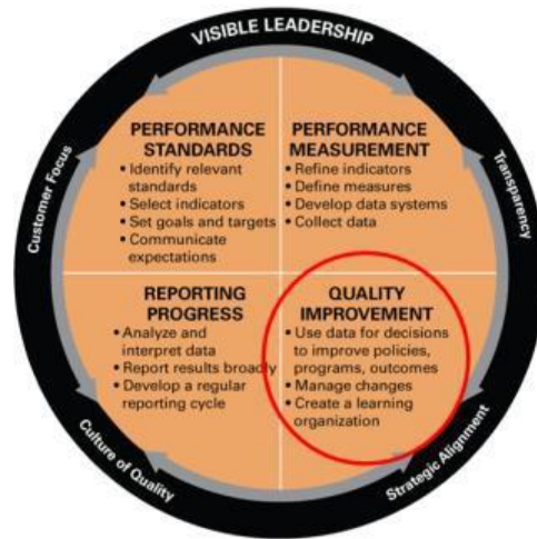
PUBLIC HEALTH PERFORMANCE MANAGEMENT SYSTEM

The health department’s goal is to integrate and maintain quality improvement into the way the agency does business, across all programs and services. This includes integration of quality improvement into its strategic vision and priorities as part of an overall performance management system. The agency has successfully implemented a continual QI process, including staff training. The FCHD will identify and complete at least one program and one administrative QI project annually.